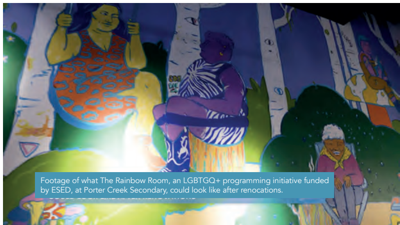
Footage of what The Rainbow Room, an LGBTQ+ programming initiative funded by ESED, at Porter Creek Secondary, could look like after renovations.

raise and award over $3 million in direct financial support to Yukon schools, school councils, First Nations governments and community organizations to help implement projects designed to boost student attendance by removing barriers and fostering increased engagement resulting in a greater sense of belonging at school.